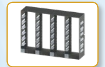
Modifiable Clip rack for Lexicon® II