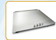
Additional Shelving Kit