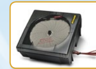
Chart Recorder Kit