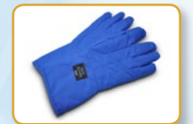
Cryo Safety Gloves