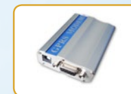
SMS Module System (for Gold controller)