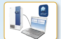
Voyager and iRMAP Software Kit