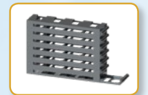
2-inch and 3-inch Drawer rack for Lexicon® II