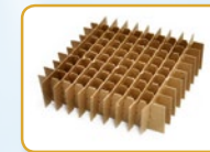
Standard Cardboard 49-cell, 64-cell, 81-cell, and 100-cell Dividers