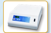
LCO 2 Back-up System