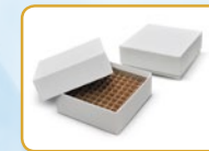
Standard Cardboard 2-inch and 3-inch Boxes